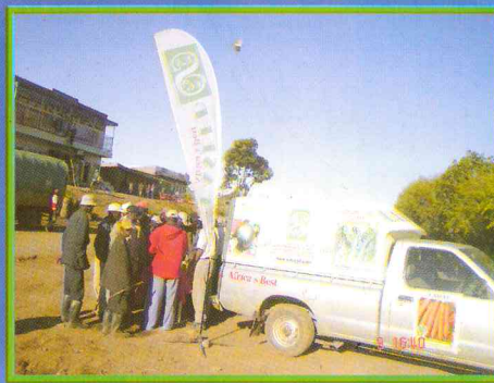
Road Show in Malindi