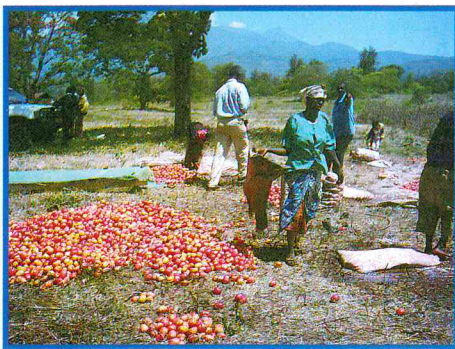
Tomato Seed extraction at the field.