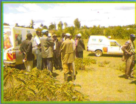
Carrot Promotion in Mau Narok

EASEED has put up Display Boards at major Distributors to facilitate information flow to the farmers about products, good agronomic practices and highlight socially beneficial issues.