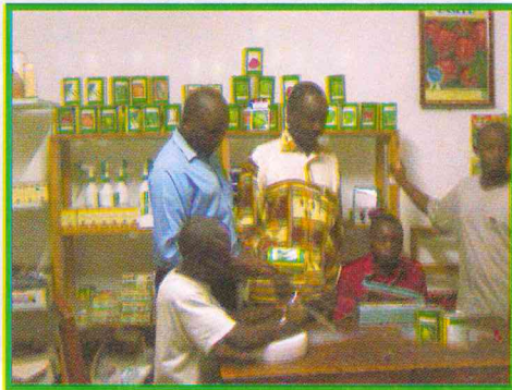
EASEED distributor AVET in Burundi

EASEED would be working closely with the local needs by organizing demonstrations and educating the farmers on usage of improved varieties and hybrids.