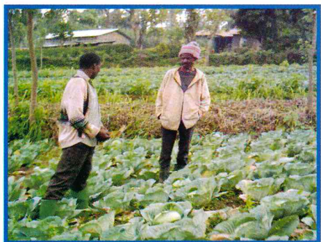
EASEED agronomist with the farmer with Hybrid Cabbage demo in Southern Highlands.

Demonstration is the key component to guide the farming community of the high quality products to choose from. It also helps them with the information on the changing agronomy practices according to the Products and the climate changes & other challenges faced. It also helps bring them closer to the company and hence increase the brand loyalty. We at EASEED have targeted such farmers in 2006 and continue the activity in 2007.