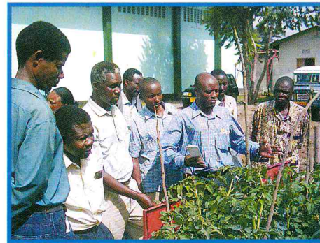
EASEED Agronomist with contracted Tomato Seed growers with display of crop.