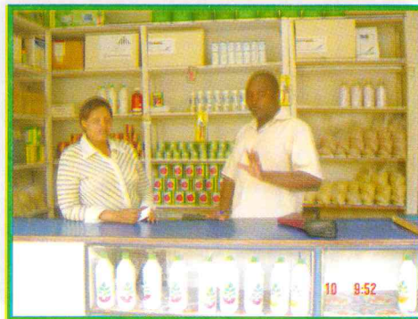
EASEED Bombay Red in one of the leading shop in Rwanda