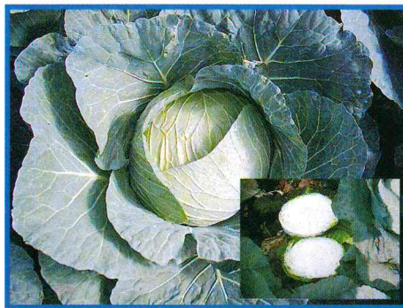
Crop display during a field day.