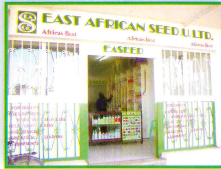
Recently renovated EASEED shop in Kampala

The new look EASEED shop is now well stocked with a range of new vegetable seeds, varieties such as Cauliflower Snow Crown F1 hybrid, Tomato Equator F1 hybrid, Tomato Nuru F1, Cabbage Globemaster F1, Tomato Rio Grande and Broccoli and many more introduced. Please visit the shop for more details and explore new opportunities in the region.