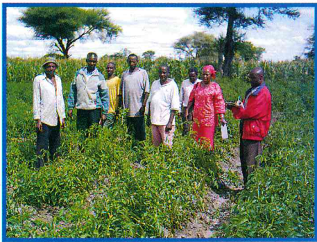
Tomato seed Grower with inspection agency and EASEED Agronomist.