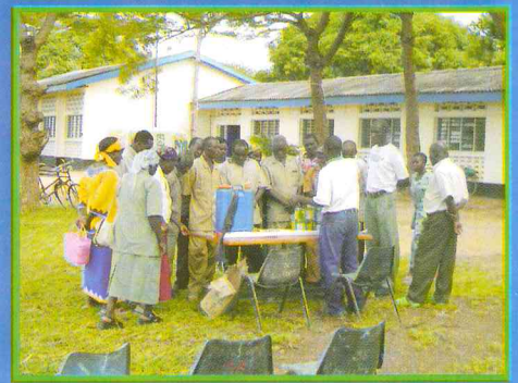
Pre-planting Field day in Kimana, Coast