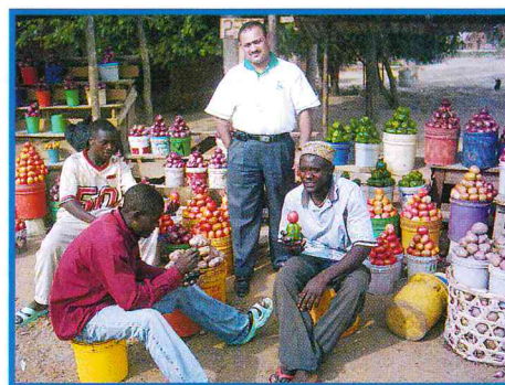
Proud Farmers with their EASEED crop at the retail outlet .